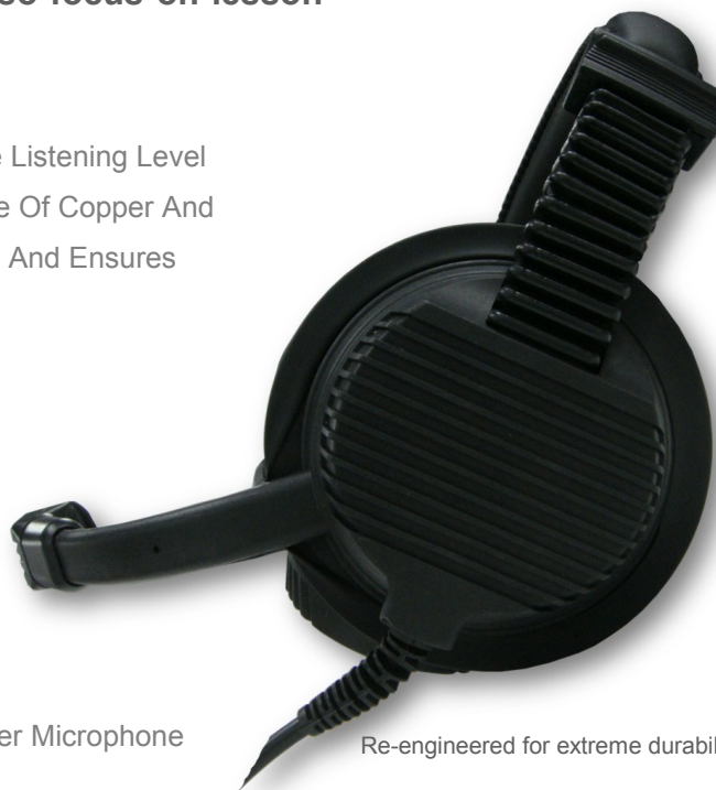
Re-engineered for extreme durability

1 year warranty against manufacturers defect