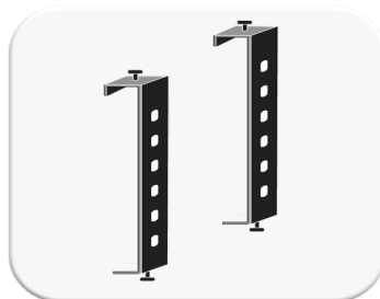
Twin Universal Hook