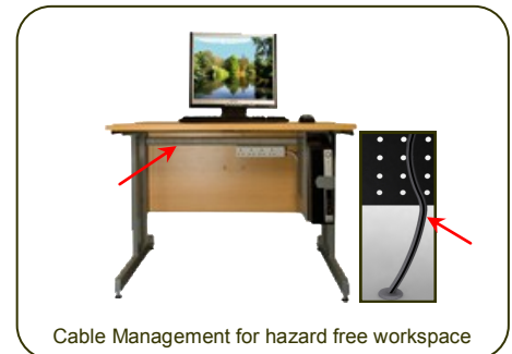
Cable Management for hazard free workspace