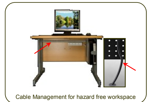
Cable Management for hazard free workspace